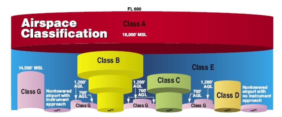
Fig. 2 Airspace classification.

On the other hand, for metropolitan areas that are located near airports, UAM operations may be conducted entirely within Class B airspace around major airports, Class C airspace around medium-sized airports, or Class D airspace around smaller airports. For example, downtown Dallas lies entirely within Class B airspace due to its proximity to Dallas-Fort Worth airport. The extent to which UAM operations would be allowed to occur in these classes of airspace would depend on the departure location, arrival location, and/or constraining factors (e.g., noise restrictions and obstacles). Under present-day rules, UAM flights would be required to communicate with ATC prior to entering Class B, C, or D airspace.