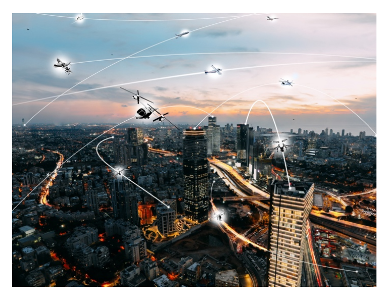
Fig. 1 Conceptual illustration of Urban Air Mobility operations.

It is expected that the earliest UAM operations of the future will be for demonstration purposes and will be required to comply with current airspace rules and regulations. It is anticipated that they will be very similar to (if not the same as) current VFR operations. Furthermore, it is expected that these initial UAM flights will be conducted by human pilots on board the UAM aircraft at all times and will have ATC providing services as in current operations. However, a number of organizations are pursuing UAM concepts that span the range of possible roles and responsibilities for humans and autonomous systems. For instance, some UAM aircraft manufacturers are working on developing vehicles that would not require a human pilot on board. These aircraft would instead be piloted remotely by some combination of humans on the ground, autonomous systems on the ground, and/or autonomous systems in the air on board the aircraft.