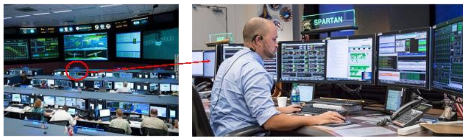
Figure 4: Data monitored by a single ISS flight control station.

Today, anomaly detection heavily relies on the capabilities of experts on the ground in the ISS Flight Control Room (FCR), Multipurpose Support Rooms, and the Mission Evaluation Room (MER) (Panontin et al., 2021). Every day, there are 80+ experts on the ground with a combined 600+ years of system-specific experience sitting console and monitoring data across these rooms. While the number of team members sitting console decreases slightly overnight, the FCR is staffed 24/7 with individuals monitoring data. Each person sitting console monitors an extensive amount of telemetry data pulled from the vehicle (see Figure 4). Crew members on the ISS typically do not have access to the telemetry data monitored by the ground, as crew members are not expected to provide any data monitoring capabilities.