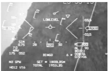
Figure 3: HUD image with chevrons

• By the high standards of their profession, only the best of the best pilots are selected to fly fighter aircraft. As such, these pilots possess a mindset of supreme confidence and low vulnerability, which they need in order to be effective in high-risk combat environments. This was supported by participant observations and responses in the surveys and interviews. In an extension of this mindset, a number of pilots commented in their interviews that Auto-GCAS will be beneficial for their colleagues but failed to mentioned how it will improve their own safety (because they are competent/good). It has been stated in interviews that "a pilot does not go out thinking he is going to crash into the ground." Pilots are very aware of the mortality of their profession, as nearly every pilot mentioned a colleague who has passed away due to CFIT. Pilots had a tendency to emphasis the need for Auto-GCAS as a benefit to the fighter pilot community, but not as a need for themselves. This attitude can lead to potential disuse of the system, and also needs further investigation.