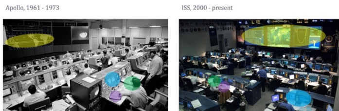
Figure 1: The evolution of mission control.

While NASA’s processes and technologies for mission operations have evolved steadily throughout the years, they have not fundamentally changed. Apollo, Shuttle, and ISS-era missions all heavily relied on experts with access to data on the ground to facilitate real-time problem solving via communication tools.